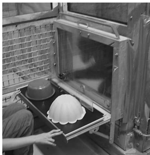
Figure 1. Apparatus. Chimpanzees and bonobos chose between fixed and risky rewards hidden under bowls.

In choices between a fixed and a risky reward option (using choice trials from all sessions), chimpanzees were risk seeking (mean \pm s.e. proportion choosing fixed option, 0.36 \pm 0.04 ), significantly preferring the risky reward ( t(4) = -3.48 , p = 0.025 one sample t -test, all reported comparisons are two-tailed). In contrast, bonobos were risk averse ( 0.72 \pm 0.03 ), preferring the fixed reward to the risky ( t(4) = 6.40 , p = 0.003 ).